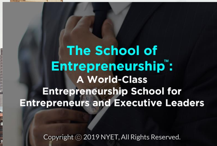
The School of Entrepreneurship ™ : A World-Class Entrepreneurship School for Entrepreneurs and Executive Leaders