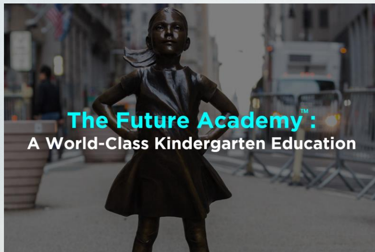
The Future Academy ™ : A World-Class Kindergarten Education