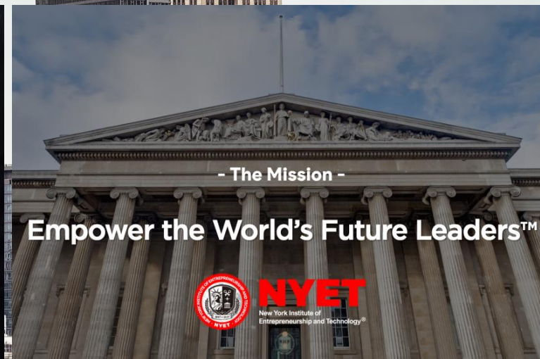
- The Mission - Empower the World's Future Leaders ™