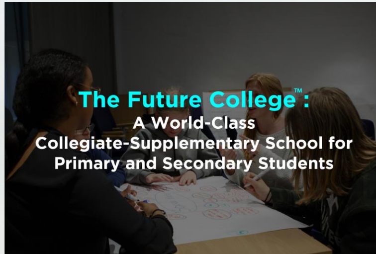
The Future College ™ : A World-Class Collegiate-Supplementary School for Primary and Secondary Students