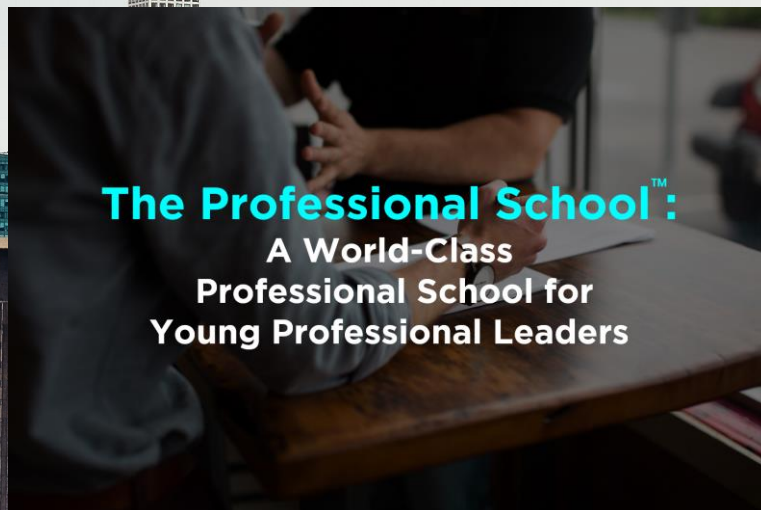
The Professional School ™ : A World-Class Professional School for Young Professional Leaders